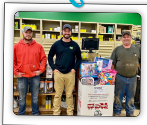
Marine Toys for Tots Foundation Toy Drive Ag-Pro Wayne County, OH