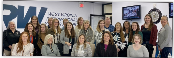
2022 Women in Aviation Luncheon